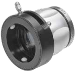
TV Coupler, manual lock, C-mount, soakable, FULL HD