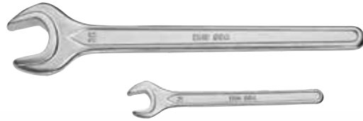
Wrench Set (SW30/SW17)