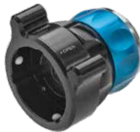
Zoom TV Coupler, C-mount, soakable, FULL HD