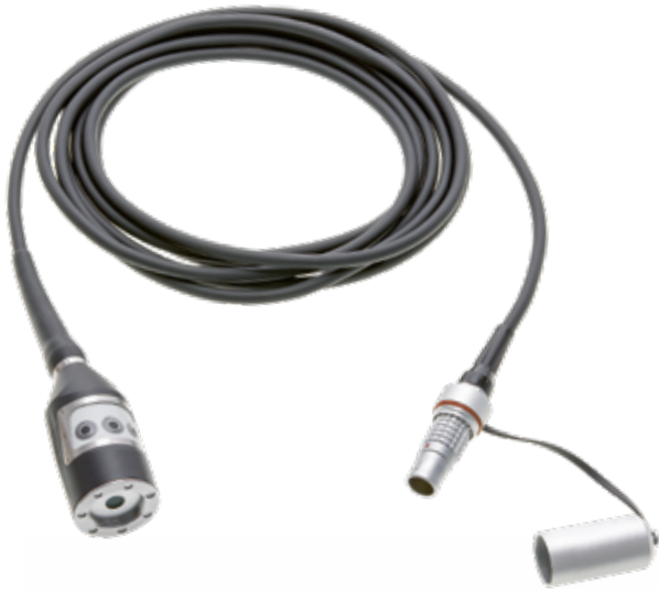
3-MOS Camera Head (included) 300-001-802