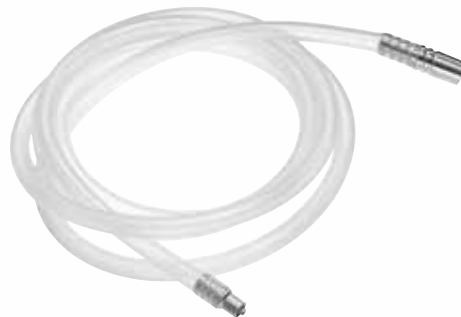
Standard Silicone Tube