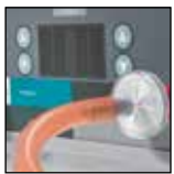
Special filters ensure sterility