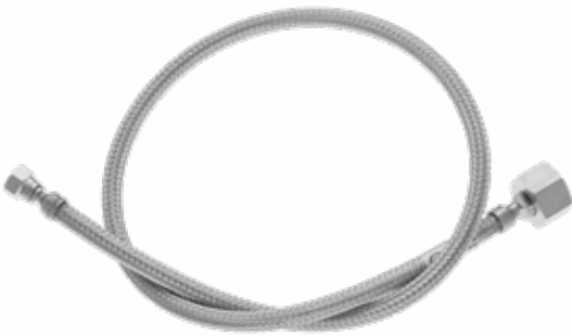
CO 2 High Pressure Tube