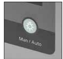
Automatic/manual light intensity control