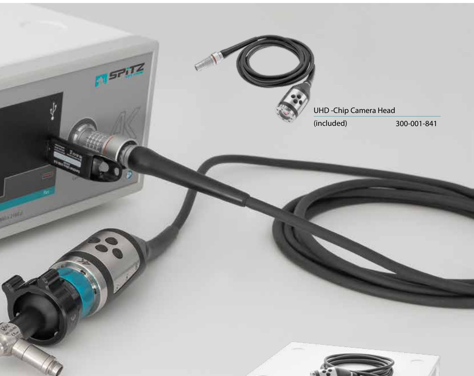
UHD -Chip Camera Head (included) 300-001-841