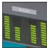
Digital display shows actual suction and irrigation pressures