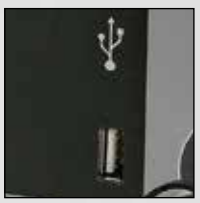
Recordingfunctionon USB pen drive