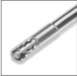
DR PitBull Shaver Blades The universal blade for soft and hard tissue