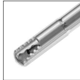
DR Waver Cutter Shaver Blades The perfect blade for soft tissue resection