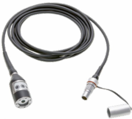
3-MOS Camera Head