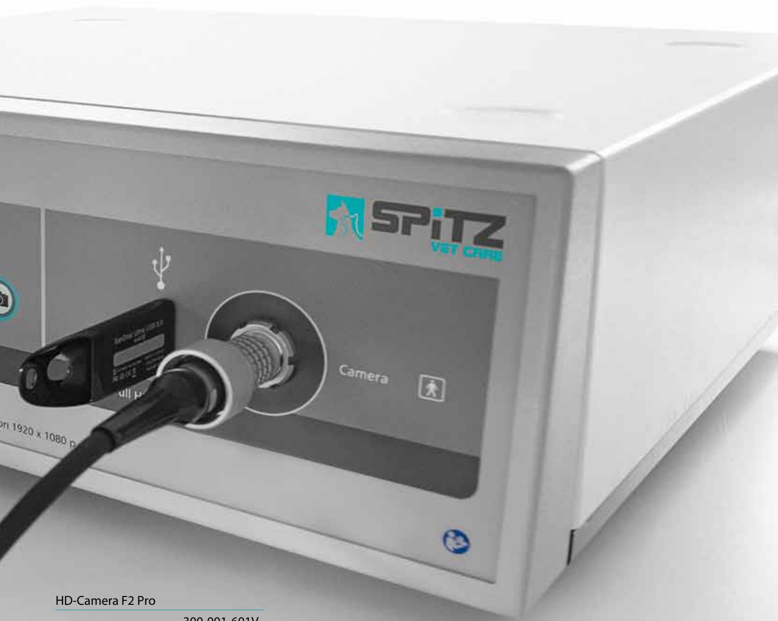
HD-Camera F2 Pro