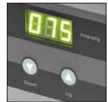
Digital light intensity display